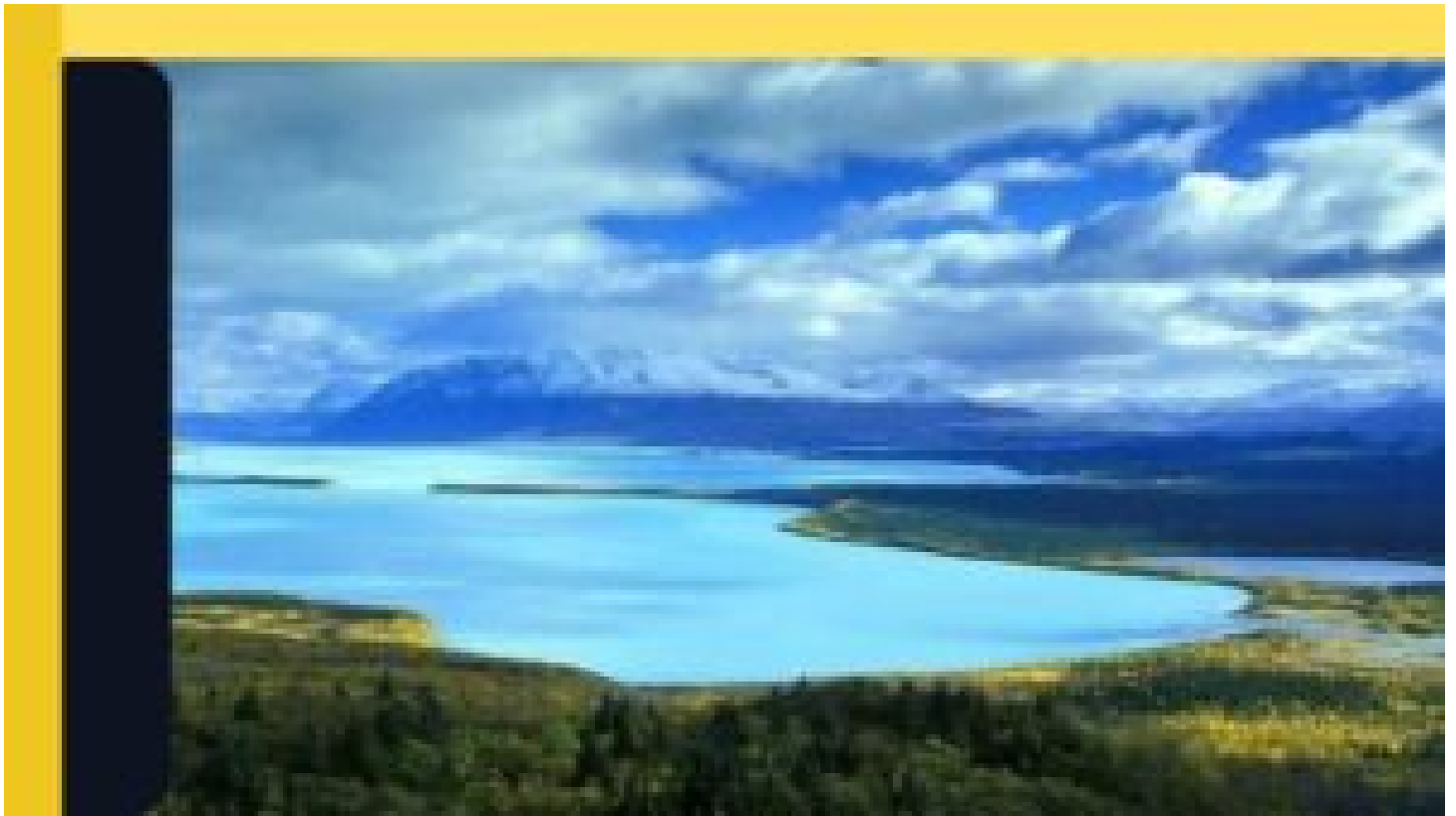
Exploring The Majestic Beauty of Lake Naknek, Alaska