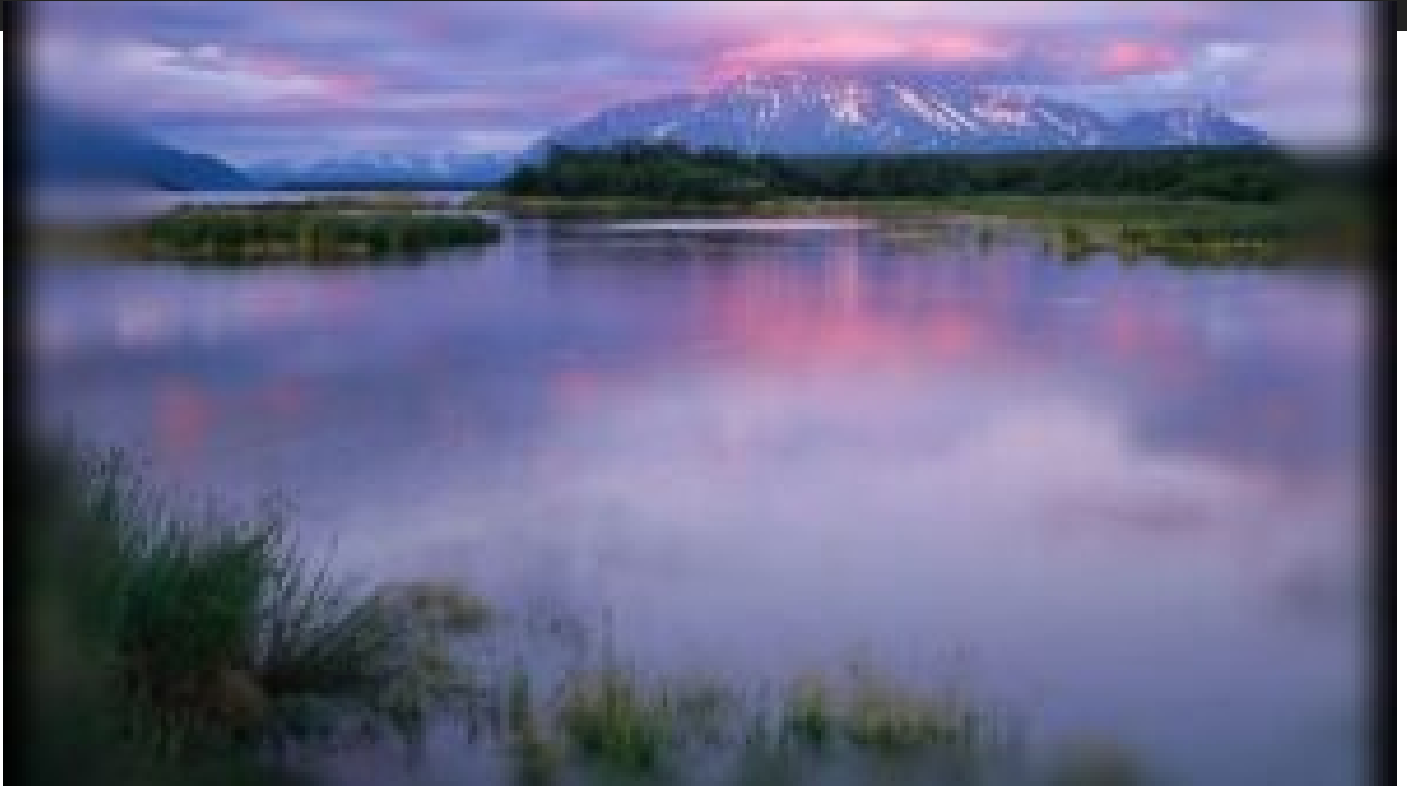
The Majestic Beauty of Naknek Lake Size Exploring its Size and Magnificence