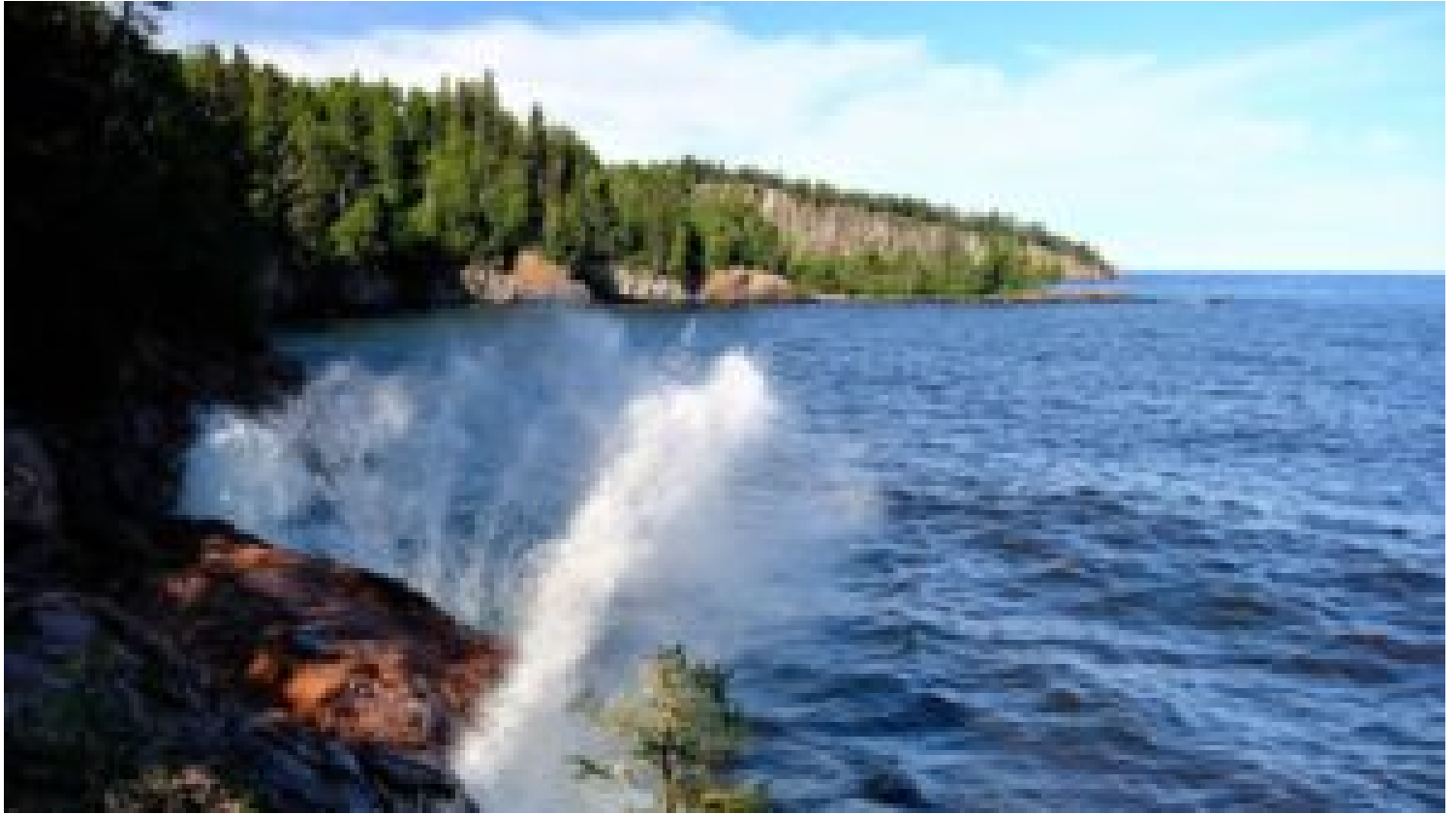
The grandeur of Lake Michigan size Exploring its Immense Size and Beauty

Cities such as Chicago, Milwaukee, and Traverse City adorn the shoreline, each offering its unique charm and attractions. From the iconic skyline of Chicago to the maritime history of Milwaukee, these cities are gateways to the wonders of Lake Michigan.