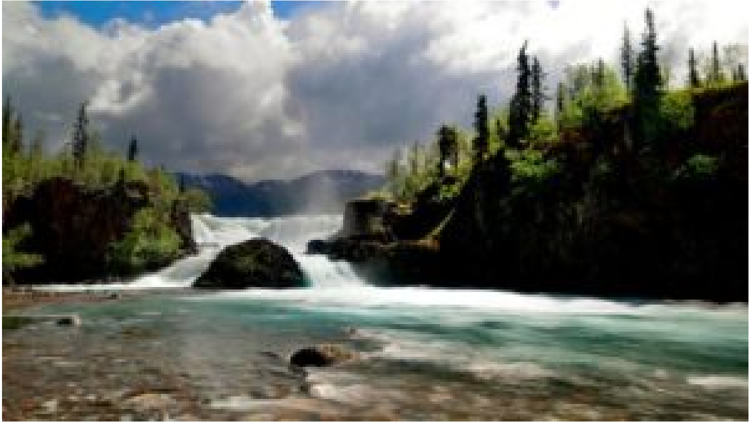
The Majesty of Lake Clark Size in Square Miles Natural Wonder

Lake Clark Size in Square Miles: In the heart of Alaska lies a gem of unparalleled beauty, a sanctuary for nature enthusiasts and wanderers alike. Welcome to Lake Clark , a mesmerizing expanse of wilderness that captivates the soul and ignites the imagination. As we embark on this journey of discovery, let us delve into the depths of its splendor, uncovering the secrets that make Lake Clark a destination like no other.