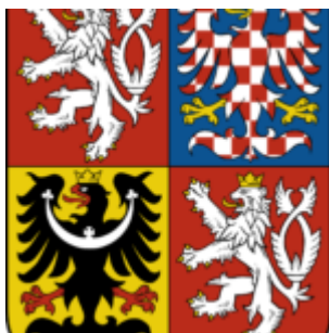
Czech Republic Double-tailed lion