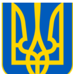
Ukraine Trident (tryzub)