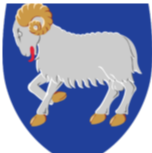
Faroe Islands Veðrur