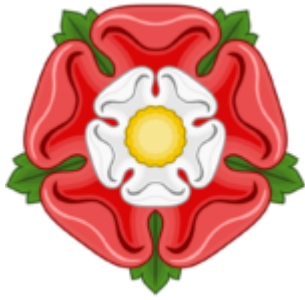
England Tudor rose