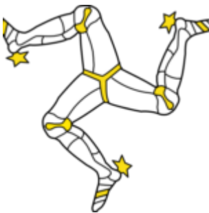
Isle of Man Manx triskelion