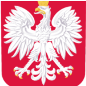
Poland White eagle