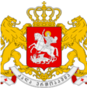
Georgia Saint George; the lion