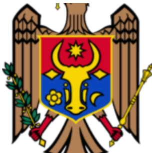
Moldova Auroch (a type of wild cattle)