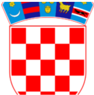
Croatia Red-white checkerboard