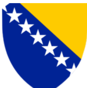
Bosnia and Herzegovina