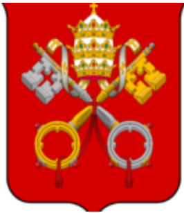
Holy See (Vatican City)

Lion (Britain in general); lion, Tudor rose (England); lion, unicorn, thistle (Scotland); dragon, daffodil, leek (Wales); harp, flax (Northern Ireland)