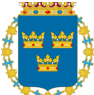
Sweden Three crowns; lion