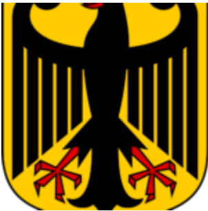
Germany Golden Eagle