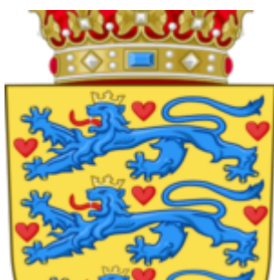
Denmark Lion; mute swan