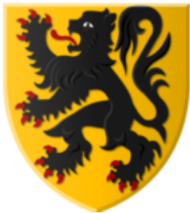
Flanders The Flemish Lion