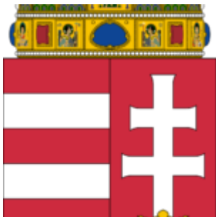
Hungary Holy Crown of Hungary (Crown of Saint Stephen); turul (falcon)