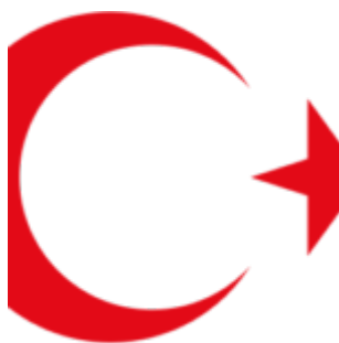
Türkiye Star and crescent