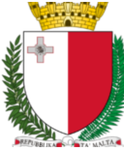
Malta Maltese cross