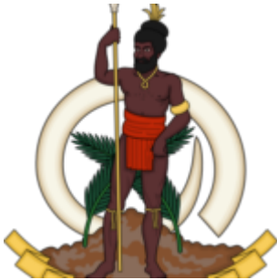
Vanuatu Boar's Tusk