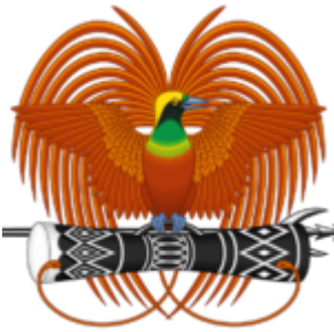
Papua New Guinea Bird of Paradise

"OLBIIL ERA KELULAU" (In Palauan for, "THE HOUSE OF THE WHISPERED DECISIONS")