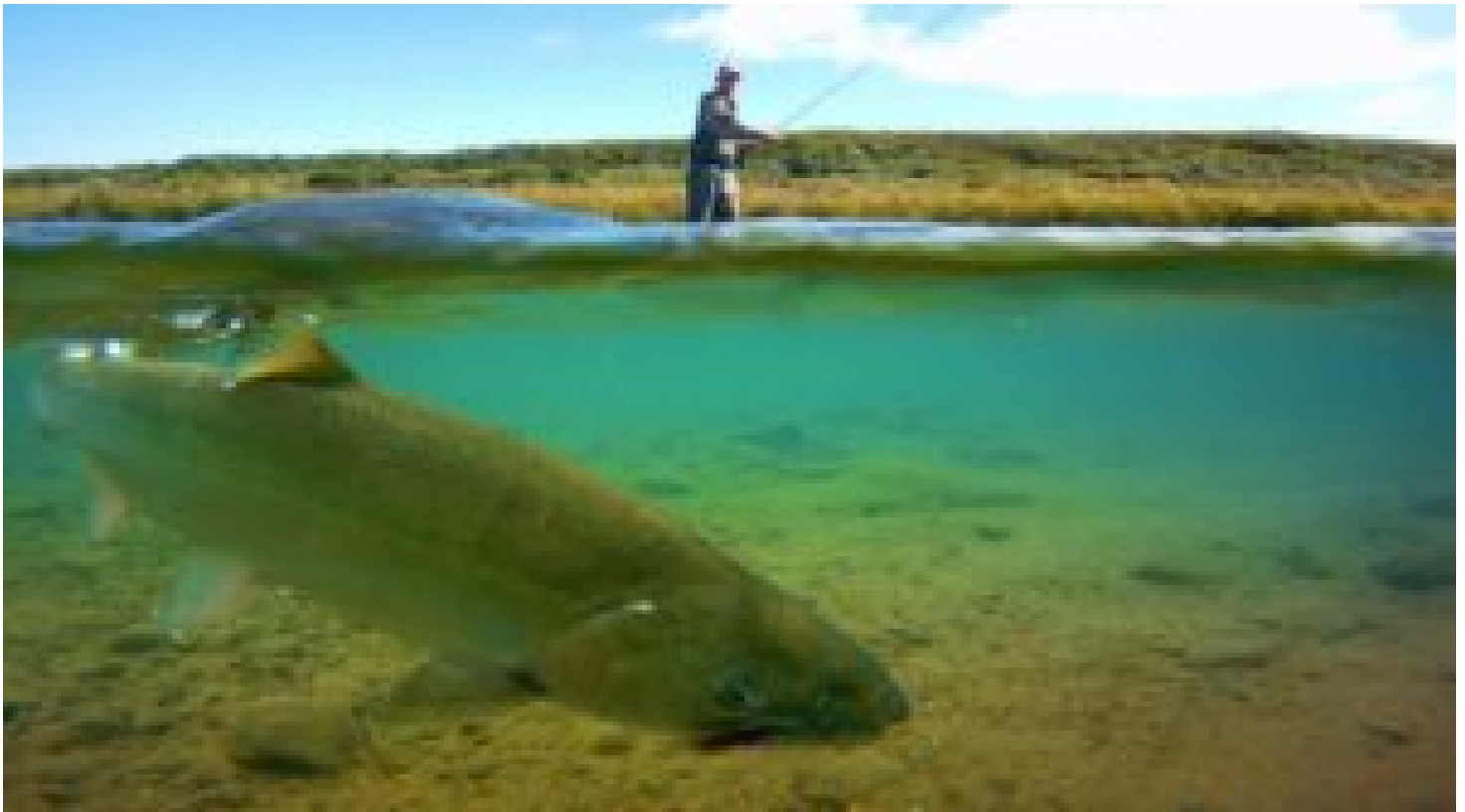
Exploring the Becharof Lake Size